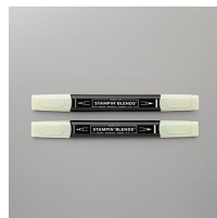
Soft Sea Foam Stampin' Blends Combo Pack