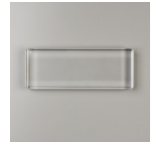
Clear Block I