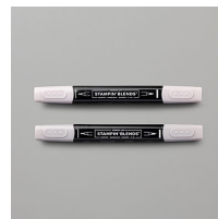
Gray Granite Stampin' Blends Combo Pack