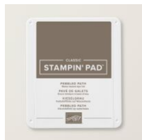
Pebbled Path Classic Stampin' Pad