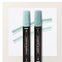
Lost Lagoon Stampin' Blends Combo Pack