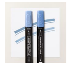
Boho Blue Stampin' Blends Combo Pack