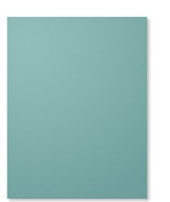
Lost Lagoon 8-1/2" X 11" Cardstock