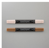
Bronze & Ivory Stampin' Blends Combo Pack