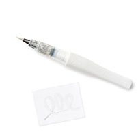
Clear Wink Of Stella Glitter Brush