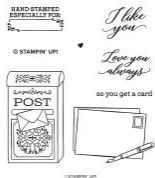
Stamped With Love