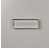
Clear Block H