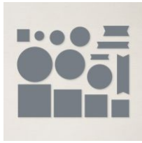
Stylish Shapes Dies