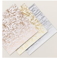
Naturally Gilded 12" X 12" (30.5 X 30.5 Cm) Specialty Designer Series Paper