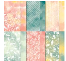
Hello, Irresistible 6" X 6" (15.2 X 15.2 Cm) Designer Series