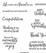
Peaceful Moments Cling