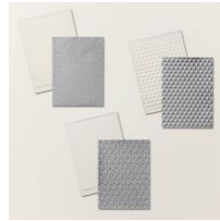
Basics 3 D Embossing Folders