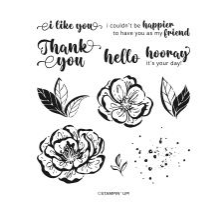
Irresistible Blooms Cling