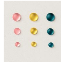
Loose Frosted Dots