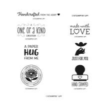
Limited Edition Cling Stamp