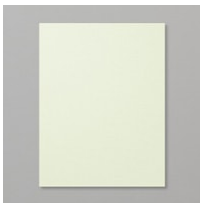
Soft Sea Foam 8-1/2" X 11"