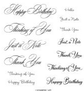
Go To Greetings Cling Stamp