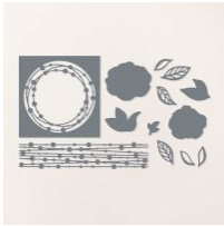
Irresistible Blooms Dies