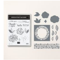
Irresistible Blooms Bundle