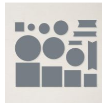
Stylish Shapes Dies