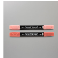
Calypso Coral Stampin'