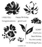
Art Gallery Photopolymer