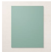
Soft Succulent 8 1/2" X 11"