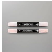
Petal Pink Stampin' Blends