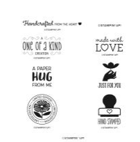
Limited Edition Cling Stamp