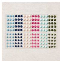
Solid Faceted Gems