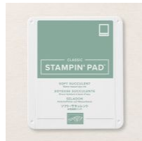
Soft Succulent Classic