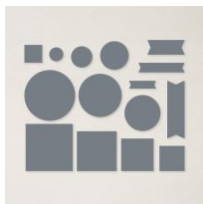
Stylish Shapes Dies