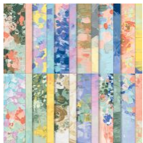
Fancy Flora 6" X 6" (15.2 X 15.2