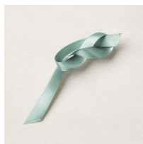
Soft Succulent 1/2" (1.3 Cm)