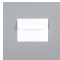
Basic White Medium