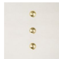
Gold Adhesive Backed Swirls