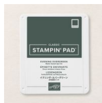
Evening Evergreen Classic Stampin' Pad