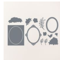
Framed Florets Dies