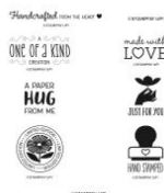
Limited Edition Cling Stamp