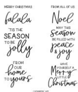
Framed & Festive Cling Stamp Set (English)