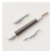
Take Your Pick