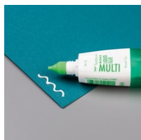
Multipurpose Liquid Glue