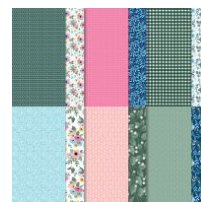
Fitting Florets 12" X 12" (30.5 X 30.5 Cm) Designer Series