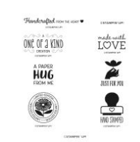
Limited Edition Cling Stamp