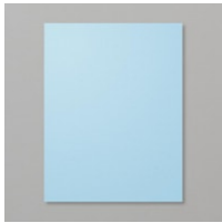
Balmy Blue 8-1/2" X 11"