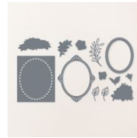
Framed Florets Dies