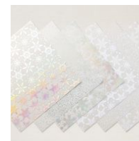
Snowflake 12 X 12 (30.5 X 30.5