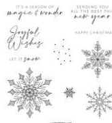
Joyful Flurry Cling Stamp Set