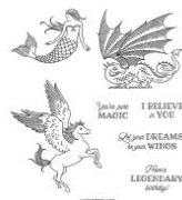
Pure Magic Cling Stamp Set