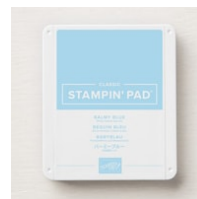
Balmy Blue Classic Stampin'