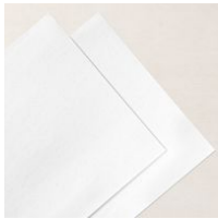
Snowy White 12" X 12" (30.5 X 30.5 Cm) Velvet Sheets [156405] $5.00