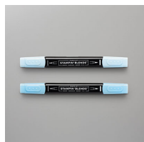
Balmy Blue Stampin' Blends