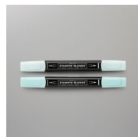
Pool Party Stampin' Blends