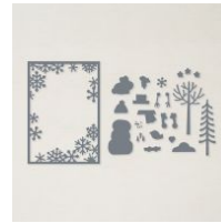
Snowman Dies [159817] $28.00