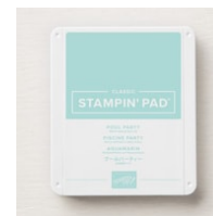
Pool Party Classic Stampin'