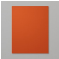
Cajun Craze 8-1/2" X 11" Cardstock [119684] $9.25