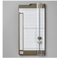
Paper Trimmer [152392] $25.00