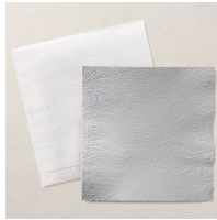
Timber 3 D Embossing Folder [156406] $10.00