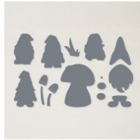
Gnomes Dies [159625] $31.00