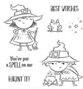
Best Witches Cling Stamp Set (English) [159860] $21.00