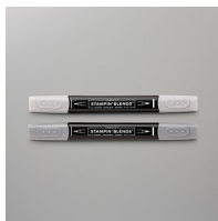
Smoky Slate Stampin' Blends Combo Pack [154904] $9.00