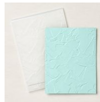
Painted Texture 3 D Embossing Folder