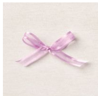
Fresh Freesia 3/8" (1 Cm)