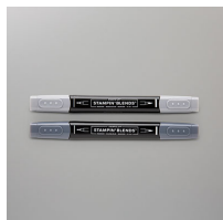
Basic Black Stampin' Blends Combo Pack [154843] $9.00