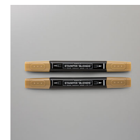
Soft Suede Stampin' Blends Combo Pack [154906] $9.00