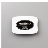
Tuxedo Black Memento Ink Pad [132708] $6.00