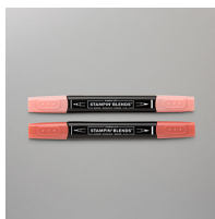
Calypso Coral Stampin' Blends Combo Pack [154881] $9.00