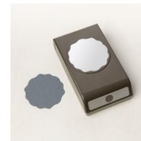
Decorative Circle Punch