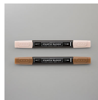
Bronze & Ivory Stampin' Blends Combo Pack [154922] $9.00