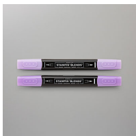
Highland Heather Stampin' Blends Combo Pack [154887] $9.00