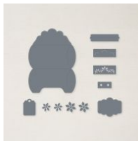
Pretty Pillowbox Dies