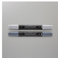
Basic Black Stampin' Blends