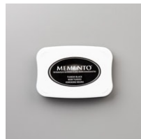
Tuxedo Black Memento Ink