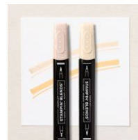
Stampin' Blends Medium