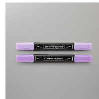
Highland Heather Stampin'