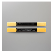
Daffodil Delight Stampin'