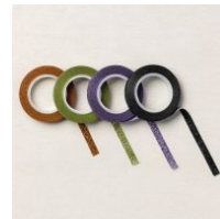
Glitter Washi Four Pack [159973] $9.00