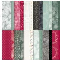
Lights Aglow 6" X 6" (15.2 X 15.2 Cm) Specialty Designer Series Paper [159535] $15.00