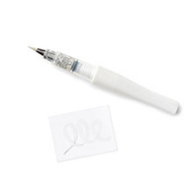
Clear Wink Of Stella Glitter