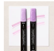
Fresh Freesia Stampin'