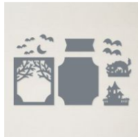
Scary Silhouettes Dies [159851] $24.00