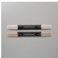
Crumb Cake Stampin' Blends