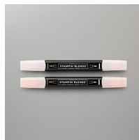
Petal Pink Stampin' Blends