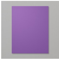
Gorgeous Grape 8-1/2" X 11" Cardstock [146987] $9.25