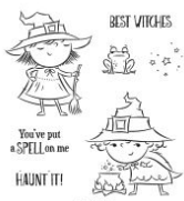
Best Witches Cling Stamp Set