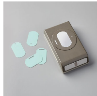
Label Me Fancy Punch [151297] $19.00