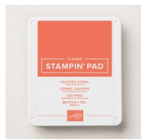
Calyпсо Coral Classic