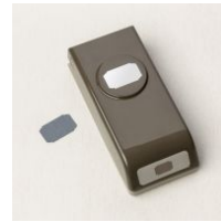
Best Label Punch