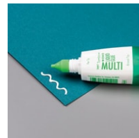
Multipurpose Liquid Glue