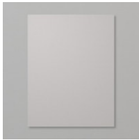
Gray Granite 8-1/2" X 11"