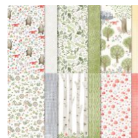
Happy Forest Friends 12" X 12"