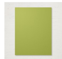
Old Olive 8-1/2" X 11"