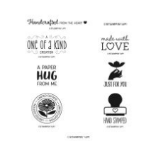
Limited Edition Cling Stamp Set (English)