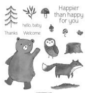
Happier Than Happy Cling