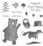
Happier Than Happy Cling