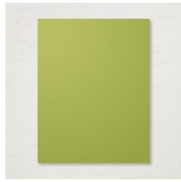
Old Olive 8-1/2" X 11" Cardstock [100702] $9.25