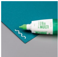
Multipurpose Liquid Glue [110755] $4.00