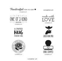
Limited Edition Cling Stamp Set (English) [158754] $19.00