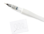
Clear Wink Of Stella Glitter