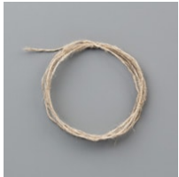
Linen Thread [104199] $5.00