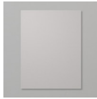
Gray Granite 8-1/2" X 11" Cardstock [146983] $9.25