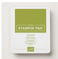
Old Olive Classic Stampin'