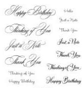
Go To Greetings Cling Stamp