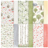
Happy Forest Friends 12" X 12" (30.5 X 30.5 Cm) Designer Series Paper [158941] $12.00