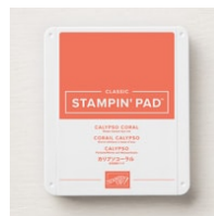
Calypso Coral Classic