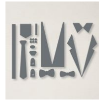
Suit & Tie Dies