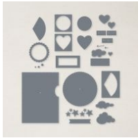
Give It A Whirl Dies