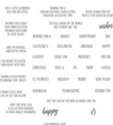
A Wish For Everything Cling