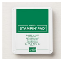
Shaded Spruce Classic