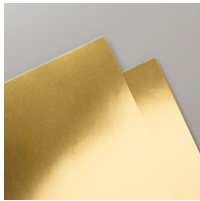
Gold Foil Sheets