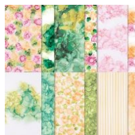
Expressions In Ink 12" X 12"

(30.5 X 30.5 Cm) Specialty Designer Series Paper