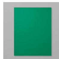
Shaded Spruce 8-1/2" X 11"