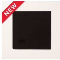
Stamparatus® Foam Mat