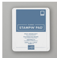
Misty Moonlight Classic Stampin' Pad [153118] $7.50