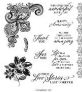
Elegantly Said Cling Stamp Set [155095] $23.00