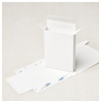
Sweet Little Boxes [157628] $10.00