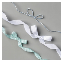
Flowers For Every Season Ribbon Combo Pack [153620] $10.00