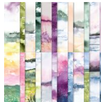
New Horizons 6" X 6" (15.2 X 15.2 Cm) Designer Series Paper [157768] $11.50