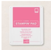
Polished Pink Classic Stampin' Pad [155712] $7.50