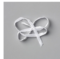
Whisper White 1/4" (6.4 Mm) Crinkled Seam Binding Ribbon [151326] $7.50