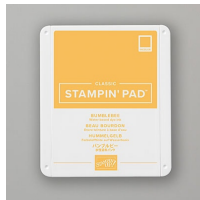
Bumblebee Classic Stampin' Pad [153116] $7.50