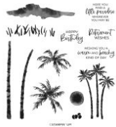
Paradise Palms Cling Stamp Set (English) [157716] $23.00