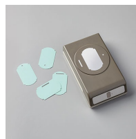
Label Me Fancy Punch [151297] $18.00