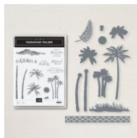
Paradise Palms Bundle [157719] $52.00