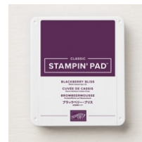
Blackberry Bliss Classic Stampin' Pad [147092] $7.50