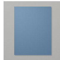
Misty Moonlight 8-1/2" X 11" Cardstock [153081] $8.75