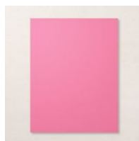
Polished Pink 8 1/2" X 11"