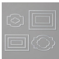
Stitched So Sweetly Dies