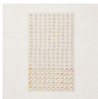
Iridescent Rhinestones Basic Jewels