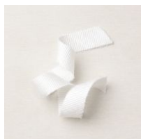
White 3/4" (1.9 Cm) Frayed Ribbon