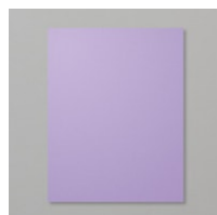
Highland Heather 8-1/2" X 11"