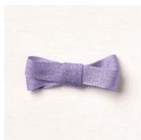
Highland Heather 1/2" (1.3 Cm) Grosgrain Ribbon