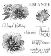
Flowing Flowers Cling Stamp