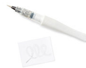
Clear Wink Of Stella Glitter