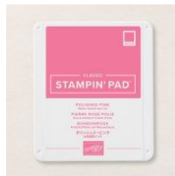
Polished Pink Classic