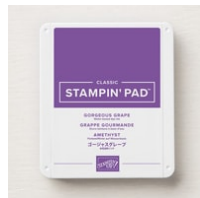
Gorgeous Grape Classic