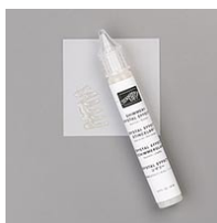
Shimmery Crystal Effects