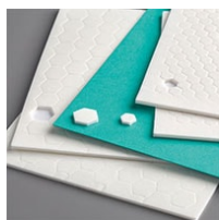
Mini Stampin' Dimensionals