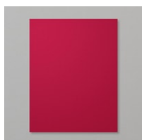
Cherry Cobbler 8-1/2" X 11"