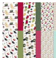
Sweet Stockings 12" X 12" (30.5 X 30.5 Cm) Designer Series