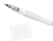
Clear Wink Of Stella Glitter