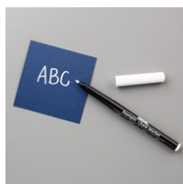
White Stampin' Chalk