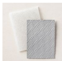
Macrame 3D Embossing