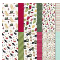
Sweet Stockings 12" X 12" (30.5 X 30.5 Cm) Designer Series