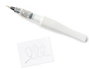
Clear Wink Of Stella Glitter