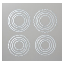
Layering Circles Dies