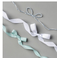
Flowers For Every Season