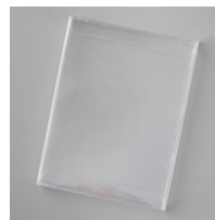
Acetate Card Boxes