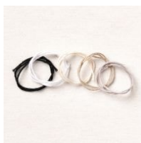
Baker's Twine Essentials