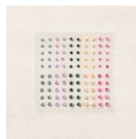
2021-2023 In Color Jewels