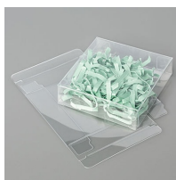
3-1/8" X 3-1/8" (7.9 X 7.9 Cm)