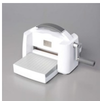
Stampin' Cut & Emboss