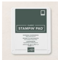
Evening Evergreen Classic Stampin' Pad