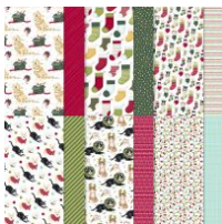
Sweet Stockings 12" X 12" (30.5 X 30.5 Cm) Designer Series Paper