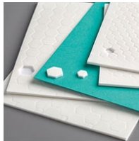
Mini Stampin' Dimensionals