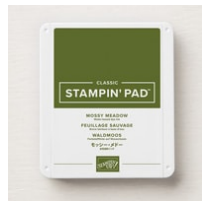
Mossy Meadow Classic Stampin' Pad