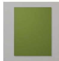
Mossy Meadow 8-1/2" X 11"