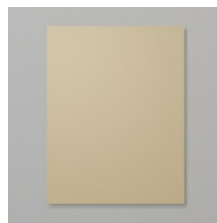
Crumb Cake 8-1/2" X 11"