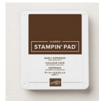
Early Espresso Classic Stampin' Pad