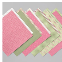
Heartwarming Hugs Designer Series Paper