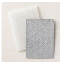
Macrame 3 D Embossing