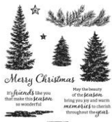
Evergreen Elegance Cling Stamp Set