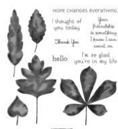
Love of Leaves Photopolymer