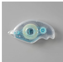
Stampin' Seal [152813] $8.00