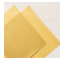
Gold 12" X 12" (30.5 X 30.5 Cm)