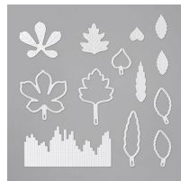
Stitched Leaves Dies [153567] $35.00