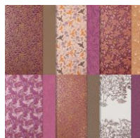
Blackberry Beauty 12" X 12"