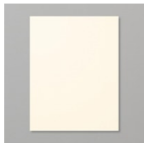
Very Vanilla 8-1/2" X 11" Cardstock [101650] $9.75