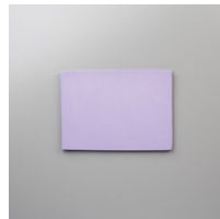
Simply Shammy [147042] $8.00