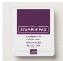
Blackberry Bliss Classic