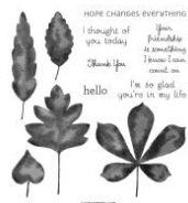
Love Of Leaves Photopolymer