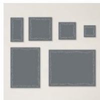
Stitched With Whimsy Dies