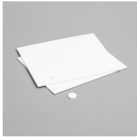
Stampin' Dimensionals [104430] $4.00