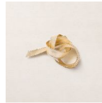
Gold 3/8" (1 Cm) Shimmer Ribbon [156470] $8.00