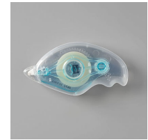
Stampin' Seal [152813] $8.00