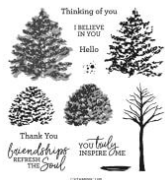
Beauty Of Friendship Photopolymer Stamp Set [154983] $22.00