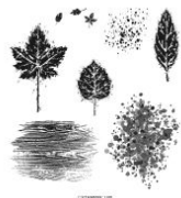
Gorgeous Leaves Cling Stamp Set [153365] $21.00