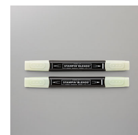
Soft Sea Foam Stampin' Blends Combo Pack [154902] $9.00