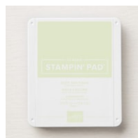
Soft Sea Foam Classic Stampin' Pad [147102] $7.50