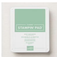
Mint Macaron Classic Stampin' Pad [147106] $7.50