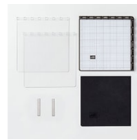
Stamparatus [146276] $49.00