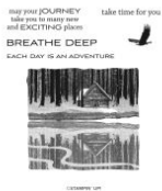
Reflected In Nature Cling Stamp Set [156437] $20.00