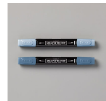
Misty Moonlight Stampin' Blends Combo Pack [153108] $9.00