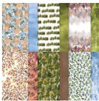
Beauty Of The Earth 12" X 12" (30.5 X 30.5 Cm) Designer Series Paper [155841] $11.50