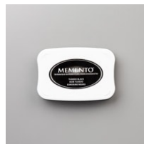
Tuxedo Black Memento Ink Pad [132708] $6.00