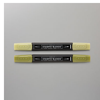
Old Olive Stampin' Blends Combo Pack [154892] $9.00