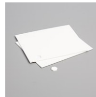
Stampin' Dimensionals [104430] $4.00