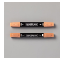
Cinnamon Cider Stampin' Blends Combo Pack [153105] $9.00