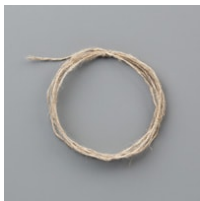
Linen Thread [104199] $5.00