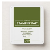
Mossy Meadow Classic Stampin' Pad [147111] $7.50