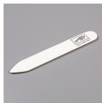
Bone Folder [102300] $7.00