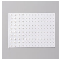
Pearl Basic Jewels [144219] $5.00