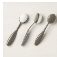
Blending Brushes [153611] $12.00