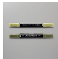
Mossy Meadow Stampin' Blends Combo Pack [154890] $9.00