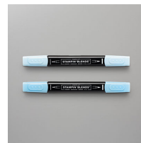
Balmy Blue Stampin' Blends Combo Pack [154830] $9.00