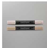
Crumb Cake Stampin' Blends Combo Pack [154882] $9.00