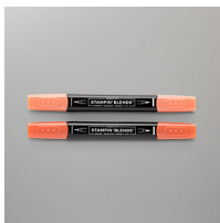
Cajun Craze Stampin' Blends Combo Pack [154879] $9.00