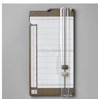
Paper Trimmer [152392] $25.00