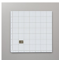
Stamparatus Deluxe Foam