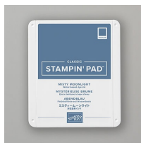
Misty Moonlight Classic