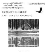
Reflected In Nature Cling