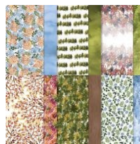
Beauty Of The Earth 12" X 12" (30.5 X 30.5 Cm) Designer