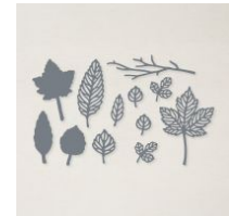
Intricate Leaves Dies