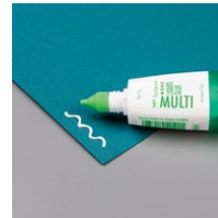
Multipurpose Liquid Glue