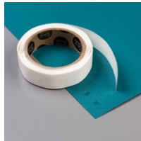
Mini Glue Dots