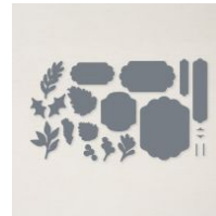
Seasonal Labels Dies