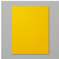
Crushed Curry 8-1/2" X 11"