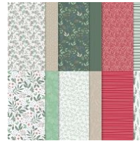
Tidings Of Christmas 6" X 6" (15.2 X 15.2 Cm) Designer Series Paper [155718] $11.50