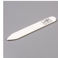
Bone Folder [102300] $7.00