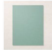
Soft Succulent 8 1/2" X 11" Cardstock [155776] $8.75