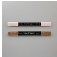
Bronze & Ivory Stampin' Blends Combo Pack [154922] $9.00