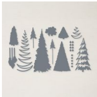
Christmas Trees Dies [156339] $35.00