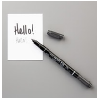
Basic Black Stampin' Write Marker [100082] $3.00