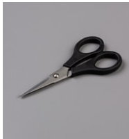
Paper Snips [103579] $10.00