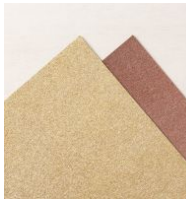
Gold & Rose Gold 6" X 6" (15.2 X 15.2 Cm) Metallic Specialty Paper [156844] $5.00