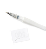
Clear Wink Of Stella Glitter Brush [141897] $8.00