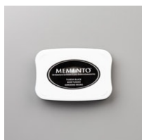
Tuxedo Black Memento Ink Pad [132708] $6.00