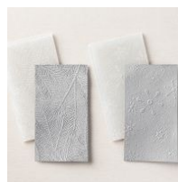
Wintry 3 D Embossing Folders [155433] $10.00