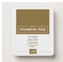
Soft Suede Classic Stampin' Pad [147115] $7.50