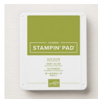
Old Olive Classic Stampin' Pad [147090] $7.50