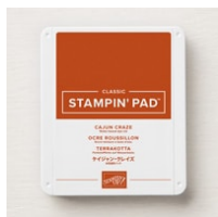
Cajun Craze Classic Stampin' Pad [147085] $7.50