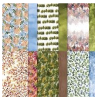
Beauty Of The Earth 12" X 12" (30.5 X 30.5 Cm) Designer Series Paper [155841] $11.50