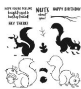
Nuts About Squirrels Photopolymer Stamp Set [156475] $17.00