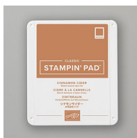
Cinnamon Cider Classic Stampin' Pad [153114] $7.50