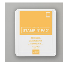
Bumblebee Classic Stampin' Pad [153116] $7.50