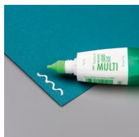
Multipurpose Liquid Glue [110755] $4.00