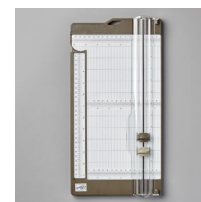
Paper Trimmer [152392] $25.00