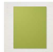
Old Olive 8-1/2" X 11" Cardstock [100702] $8.75