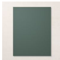
Evening Evergreen 8 1/2" X 11" Cardstock [155574] $8.75