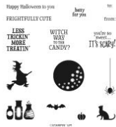
Frightfully Cute Cling Stamp Set [156487] $19.00