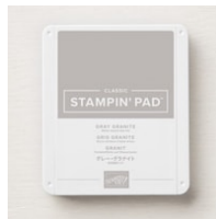
Gray Granite Classic Stampin' Pad [147118] $7.50