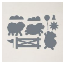
Sheep Dies [156600] $0.00