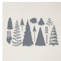
Christmas Trees Dies [156339] $35.00