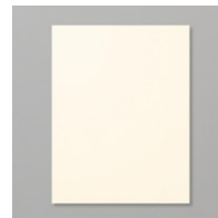
Very Vanilla 8-1/2" X 11" Cardstock [101650] $9.75