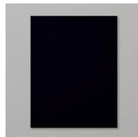
Basic Black 8-1/2" X 11" Cardstock [121045] $8.75