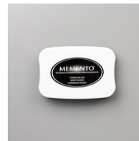
Tuxedo Black Memento Ink Pad [132708] $6.00