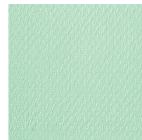
Tasteful Textile 3D Embossing Folder [152718] $9.00