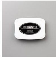
Tuxedo Black Memento Ink Pad