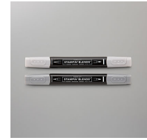
Smoky Slate Stampin' Blends Combo Pack