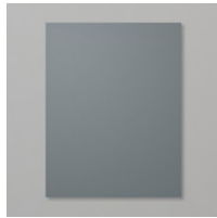
Basic Gray 8-1/2" X 11" Cardstock