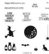
Frightfully Cute Cling Stamp Set