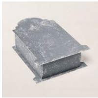
Tombstone Treat Boxes