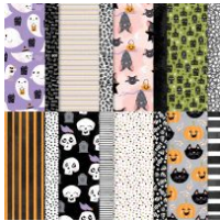
Cute Halloween 6" X 6" (15.2 X 15.2 Cm) Designer Series Paper