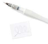
Clear Wink Of Stella Glitter Brush