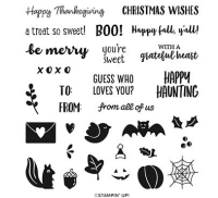
Banner Year Photopolymer Stamp Set (English)