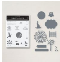
Frightfully Cute Bundle