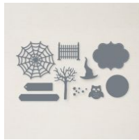
Frightful Tags Dies