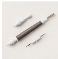
Take Your Pick