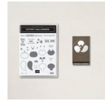
Cutest Halloween Bundle