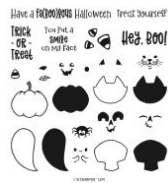
Cutest Halloween Photopolymer Stamp Set