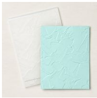
Painted Texture 3 D Embossing Folder