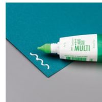
Multipurpose Liquid Glue