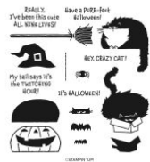
Clever Cats Photopolymer Stamp Set