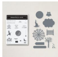
Frightfully Cute Bundle [156493] $41.25