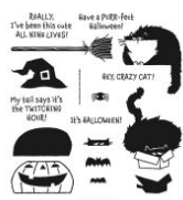
Clever Cats Photopolymer Stamp Set [156490] $17.00