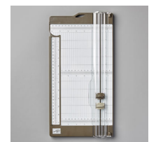
Paper Trimmer [152392] $25.00