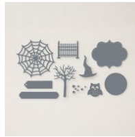
Frightful Tags Dies