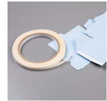
Tear & Tape Adhesive