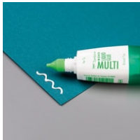
Multipurpose Liquid Glue