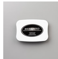
Tuxedo Black Memento Ink Pad [132708] $6.00