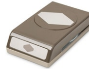
Tailored Tag Punch [145667] $18.00