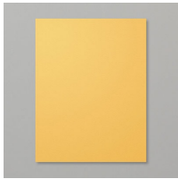
Bumblebee 8-1/2X11 Cardstock [153077] $8.75