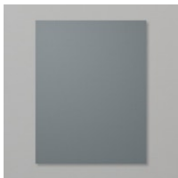
Basic Gray 8-1/2" X 11"