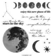
To The Moon Photopolymer