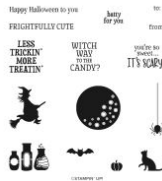
Frightfully Cute Cling Stamp