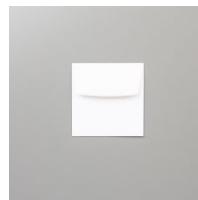
Basic White 3" X 3" (7.6 X 7.6