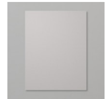
Gray Granite 8-1/2" X 11"