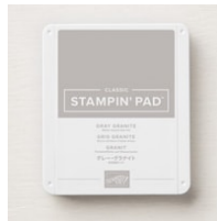
Gray Granite Classic