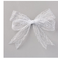
Metallic Mesh Ribbon