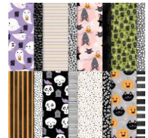
Cute Halloween 6" X 6" (15.2 X