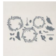
Seasonal Swirls Dies