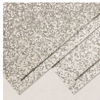
Be Dazzling 6" X 6" (15.2 X 15.2