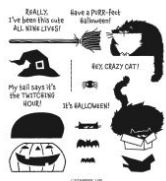
Clever Cats Photopolymer