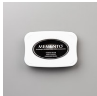
Tuxedo Black Memento Ink