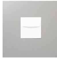
Basic White 3" X 3" (7.6 X 7.6