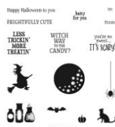
Frightfully Cute Cling Stamp