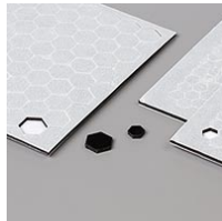
Black Stampin' Dimensionals