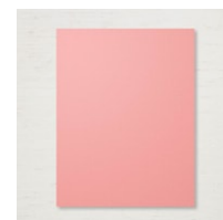
Flirty Flamingo 8-1/2" X 11"