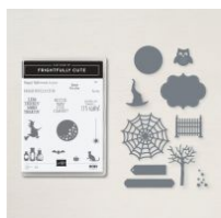
Frightfully Cute Bundle