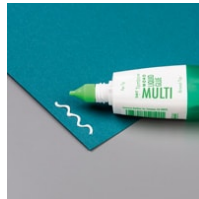
Multipurpose Liquid Glue