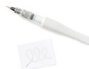
Clear Wink Of Stella Glitter