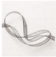
Black 5/8" (1.6 Cm) Glittered Organdy Ribbon