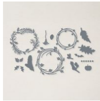
Seasonal Swirls Dies