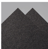
Black Glitter Paper

15.2 Cm) Designer Series Paper [156479] $11.50