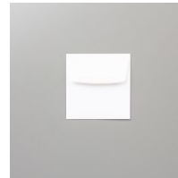
Basic White 3" X 3" (7.6 X 7.6 Cm) Envelopes