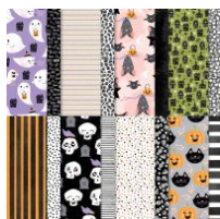
Cute Halloween 6" X 6" (15.2 X

15.2 Cm) Designer Series Paper [156479] $11.50