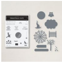
Frightfully Cute Bundle