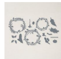
Seasonal Swirls Dies