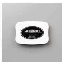
Tuxedo Black Memento Ink