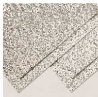
Be Dazzling 6" X 6" (15.2 X 15.2