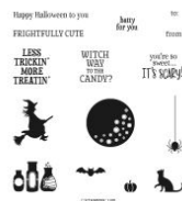
Frightfully Cute Cling Stamp