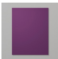
Blackberry Bliss 8-1/2" X 11"