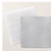
Timeworn Type 3 D