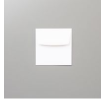
Basic White 3" X 3" (7.6 X 7.6