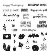
Banner Year Photopolymer Stamp Set (English)