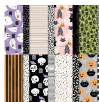
Cute Halloween 6" X 6" (15.2 X 15.2 Cm) Designer Series Paper