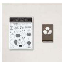
Cutest Halloween Bundle