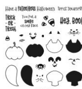
Cutest Halloween Photopolymer Stamp Set