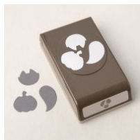
Halloween Punch [156482] $18.00