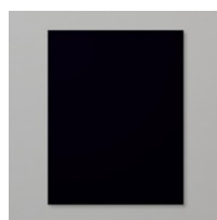
Basic Black 8-1/2" X 11"