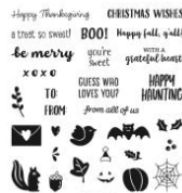
Banner Year Photopolymer