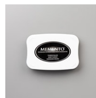
Tuxedo Black Memento Ink