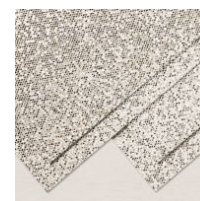
Be Dazzling 6" X 6" (15.2 X 15.2