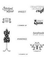
Handmade For You Cling Stamp Set [I54494] $17.00