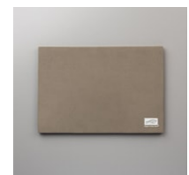
Stampin' Pierce Mat