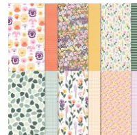
Pansy Petals 12" X 12" (30.5 X 30.5 Cm) Designer Series