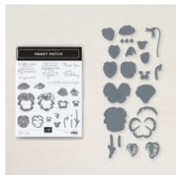
Pansy Patch Bundle (English)