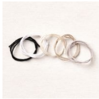
Baker's Twine Essentials Pack [I55475] $11.00