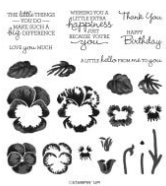
Pansy Patch Photopolymer