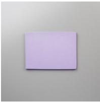
Simply Shammy [I47042] $8.00