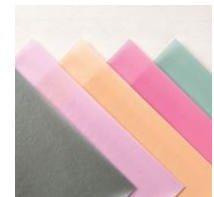
2021-2023 In Color Shimmer