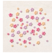
Loose Flower Flourishes [155808] $7.50