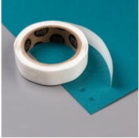
Mini Glue Dots [103683] $5.25