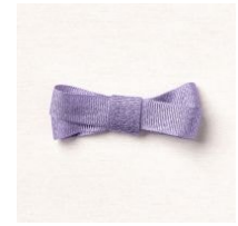
Highland Heather 1/2" (1.3 Cm) Grosgrain Ribbon [155812] $6.00