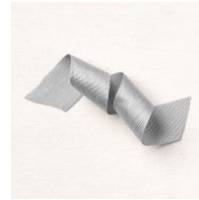
7/8" (2.2 Cm) Smoky Slate Textured Ribbon [155813] $8.50