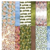
Beauty Of The Earth 12" X 12"