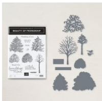
Beauty Of Friendship Bundle