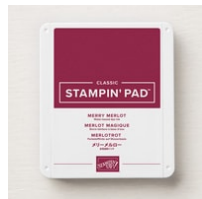
Merry Merlot Classic