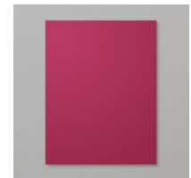
Merry Merlot 8-1/2" X 11"