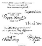
Happy Thoughts Cling Stamp