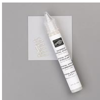
Shimmery Crystal Effects [150892] $5.00