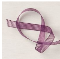
Blackberry Bliss Striped Ribbon [154569] $7.00