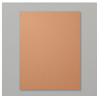
Cinnamon Cider 8-1/2" X 11"