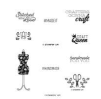
Handmade For You Cling Stamp Set [154494] $17.00