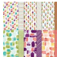
Ice Cream Corner Designer