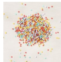
Ice Cream Corner Sprinkles [154568] $6.00