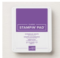
Gorgeous Grape Classic