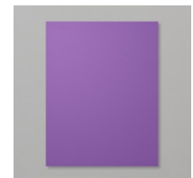
Gorgeous Grape 8-1/2" X 11"