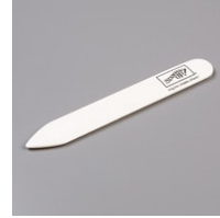
Bone Folder [102300]