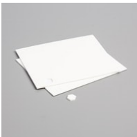
Stampin' Dimensionals [104430]