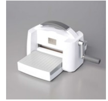
Stampin' Cut & Emboss Machine [149653]