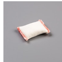
Embossing Buddy [103083]