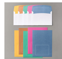
Flowers For Every Season Memories & More Cards & Envelopes [153101]