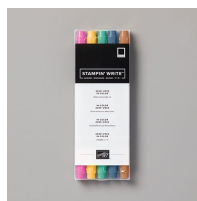
2020-2022 In Color Stampin' Write Marker Assortment [153125]