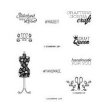
Handmade For You Cling Stamp Set [154494]