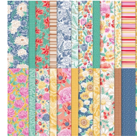
Flowers For Every Season 6" X 6" (15.2 X 15.2 Cm) Designer Series Paper [152486]