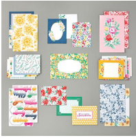
Flowers For Every Season Memories & More Card Pack [153058]