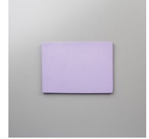
Simply Shabby [147042]