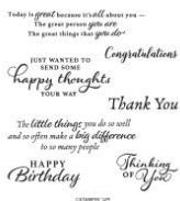
Happy Thoughts Cling Stamp Set [154507]