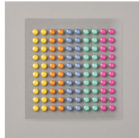
2020-2022 In Color Enamel Dots [152480]