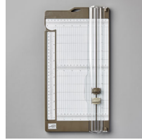
Paper Trimmer [152392]