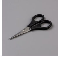
Paper Snips [103579]