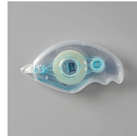
Stampin' Seal [152813]