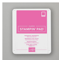
Magenta Madness Classic Stampin' Pad [153117]