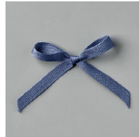
Misty Moonlight 1/4" (6.4 Mm) 2020-2022 In Color Ribbon [153624]