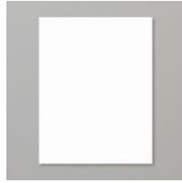
Basic White 8 1/2" X 11" Cardstock [159276]