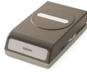
Classic Label Punch