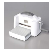
Stampin' Cut & Emboss Machine