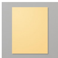
So Saffron 8-1/2" X 11"