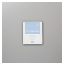
Seaside Spray Classic Stampin' Pad