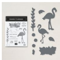
Friendly Flamingo Bundle