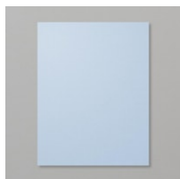
Seaside Spray 8-1/2" X 11"