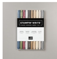
Neutrals Stampin' Write Markers