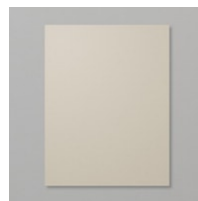
Sahara Sand 8-1/2" X 11"