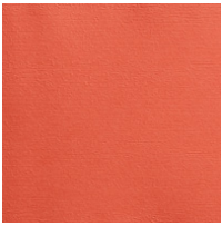
Subtle 3D Embossing Folder