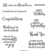
Peaceful Moments Cling