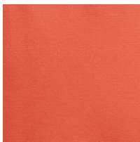
Subtle 3D Embossing Folder