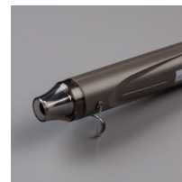
Heat Tool (Us And Canada)