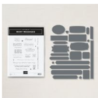
Many Messages Bundle