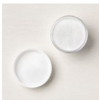
Heat & Stick Powder