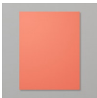
Calypso Coral 8-1/2" X 11"