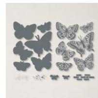
Brilliant Wings Dies