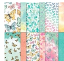
Butterfly Bijou 6" X 6" (15.2 X