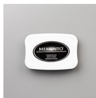
Tuxedo Black Memento Ink