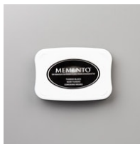
Tuxedo Black Memento Ink