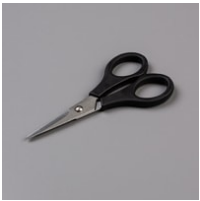
Paper Snips [103579] $10.00