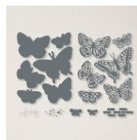
Brilliant Wings Dies