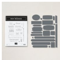
Many Messages Bundle