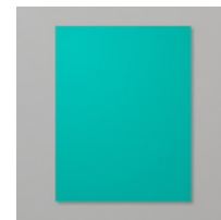
Bermuda Bay 8-1/2" X 11"