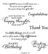
Happy Thoughts Cling Stamp