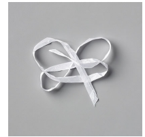
Whisper White 1/4" (6.4 Mm) Crinkled Seam Binding Ribbon [151326] $7.50