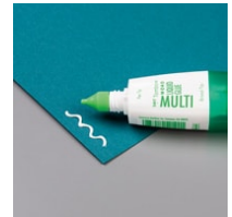
Multipurpose Liquid Glue [110755] $4.00