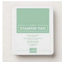
Mint Macaron Classic