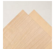
Natural Touch Specialty

15.2 Cm) Designer Series Paper [156824] $11.50