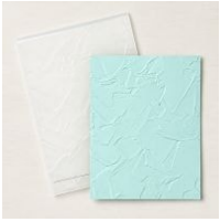
Painted Texture 3 D Embossing Folder [154317] $9.00