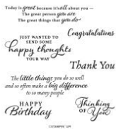
Happy Thoughts Cling Stamp