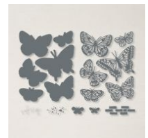
Brilliant Wings Dies