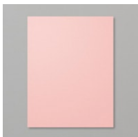
Blushing Bride 8-1/2" X 11"