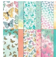
Butterfly Bijou 6" X 6" (15.2 X

15.2 Cm) Designer Series Paper [156824] $11.50