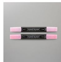
Flirty Flamingo Stampin' Blends Combo Pack