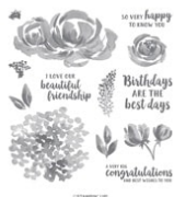
Beautiful Friendship Photopolymer Stamp Set