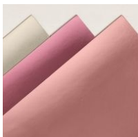
Love You Always Foil Sheets