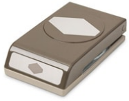
Tailored Tag Punch