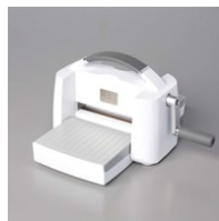
Stampin' Cut & Emboss Machine