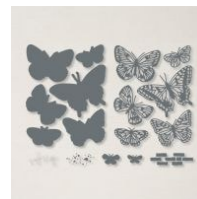
Brilliant Wings Dies