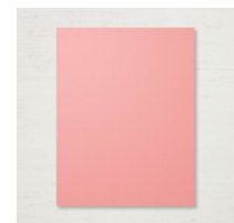
Flirty Flamingo 8-1/2" X 11" Cardstock