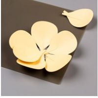
Silicone Craft Sheet