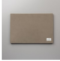
Stampin' Pierce Mat