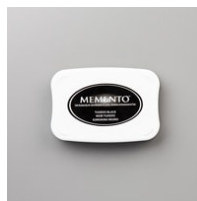
Tuxedo Black Memento Ink Pad