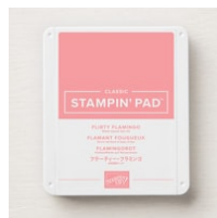
Flirty Flamingo Classic Stampin' Pad