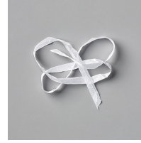
Whisper White 1/4" (6.4 Mm) Crinkled Seam Binding Ribbon