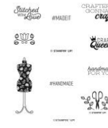
Handmade For You Cling Stamp Set