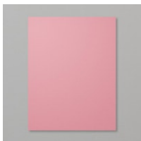
Rococo Rose 8-1/2" X 11"