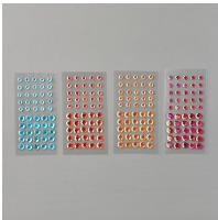
Artistry Blooms Sequins