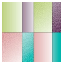
Oh So Ombre 6" X 6" (15.2 X 15.2 Cm) Designer Series