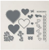
Many Hearts Dies