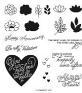
Always In My Heart Photopolymer Stamp Set