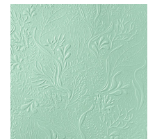
Seabed 3D Embossing Folder