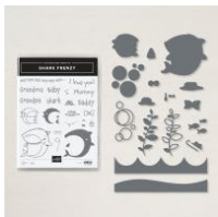
Shark Frenzy Bundle