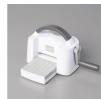
Mini Stampin' Cut & Emboss