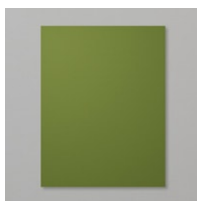
Mossy Meadow 8-1/2" X 11"