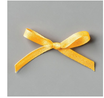
Bumblebee 1/4" (6.4 Mm) 2020-2022 In Color Ribbon [153622] $6.00