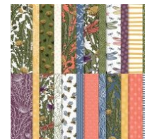
Dandy Garden 6" X 6" (15.2 X 15.2 Cm) Designer Series Paper