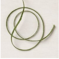
Mossy Meadow 3/16" (4.8 Mm) Braided Linen Trim [154298] $7.00