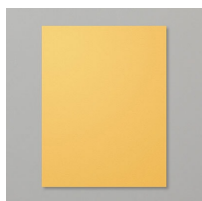
Bumblebee 8-1/2 X 11