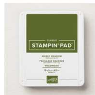
Mossy Meadow Classic Stampin' Pad