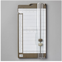
Paper Trimmer [152392] $25.00