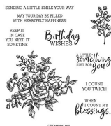
Fancy Phrases Cling Stamp Set