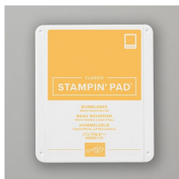
Bumblebee Classic Stampin' Pad